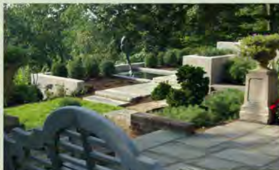
From Upper Terrace

"My heart is tuned to the quietness that the stillness of nature inspires." -Hazrat Inayat Khan