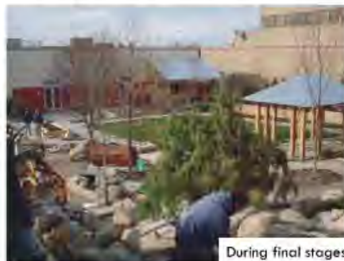
During final stages