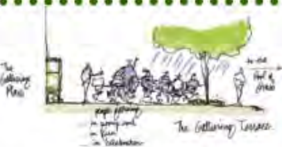
Sketch of The Gathering Terrace

The Gathering Place (TGP) is a caring community that supports individuals and families touched by cancer. Located in Cleveland, Ohio, The Gathering Place provides services and programs free of charge. Norma's Garden...A Place of Healing was designed in 2003 and built last summer/fall. The garden was designed to accommodate the programs and services offered by TGP as an integral part of their new facility. For Virginia, the project has been an experience of a lifetime where all involved have become long standing friends. A series of garden rooms designed around the themes of joy and peace include The Pool of Grass (for large events, labyrinth walks, open play, yoga), The Gathering Terrace (for smaller groups and events), The Secret Mystery Garden (for people to be alone), The Storybook Maze (for all ages to experience the magic of transformation), The Portico (a porch for smaller groups), The Pavilion (for shady sitting) The Green Rooms (for silent reflection), The Children's Garden (for play and wonder), The Edible Garden (for horticultural therapy and planting), The Entry Garden (the threshold to the garden), The Sacred Mount (the overlook). Each room has wondrous features such as the 6' high silver butterfly that is made for playing sounds or the Labyrinth Gates tracing the origins of this sacred symbol.